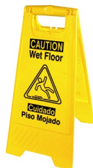
Wet Floor Sign